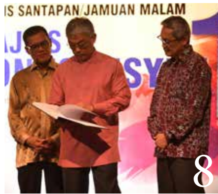
Mutiara Mahkota Launched