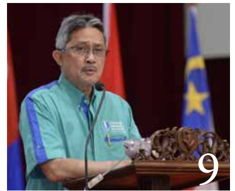
Communitising Technology – UMP’s Agenda on Versatility