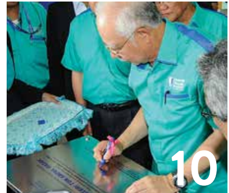
The official opening of UMP main campus and naming of Tun Abdul Razak Chancellery by PM