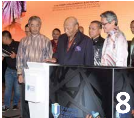
UMP launched MyGift Scholarship Award for its Undergraduates